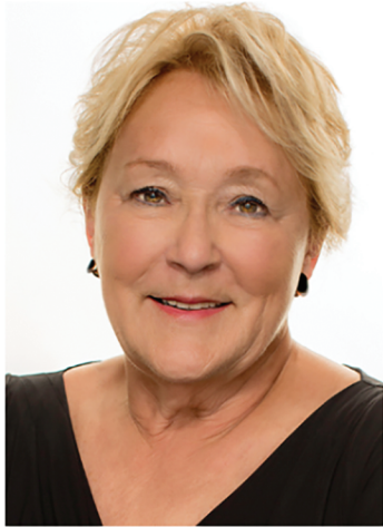
Pauline Marois Premier of Quebec, 2012 to 2014