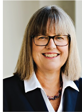
Donna Strickland Nobel Prize in Physics 2018, professor at the University of Waterloo